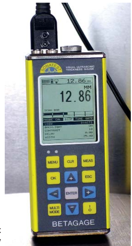
Large Digit View